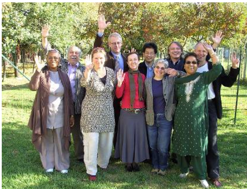
The IFOAM World Board

IFOAM is the worldwide umbrella organization for the organic agriculture movements, uniting more than 700 member organizations in 110 countries.